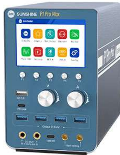
SUNSHINE P1 Pro Max