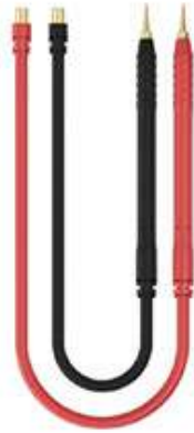
Spot welding line